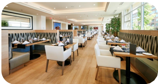
Ash Street Bistro & Licensed Bar Hours: 7:30 am to 8:00 pm

At Legacy Senior Living, visiting guests have the added comfort and convenience of reserving our elegant Main Floor Guest Suite . We are pleased to offer priority status on reservations for visiting family and friends. We encourage booking early when planning travel arrangements to avoid disappointment. Reservations are on a first come, first serve basis. Please call the Concierge Desk at 604.240.8550 for availability status.